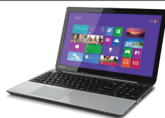
Satellite ® L55 Series Laptops