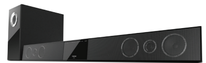
SBX4250 Sound Bar