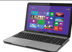
Satellite ® L855-S512