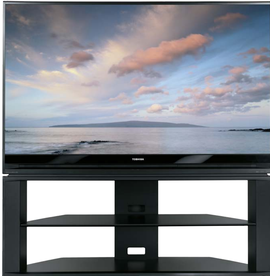
shown on optional stand ST6587

1080p Full HD Display - With Full HD, there's no need to scale down a 1080 signal. With twice the pixel resolution of 720p HD models, Full HD creates the pinnacle in picture quality.