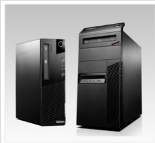
Small Form Factor Pro Expandability and functionality of a mini-Tower at just 50% of the size