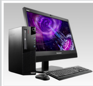
Graphic Experience life-like video quality with discrete graphics up to NVIDIA® Quadro® 410 4