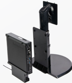
ThinkCentre® Tiny L-Bracket Mounting Kit (0B47373)