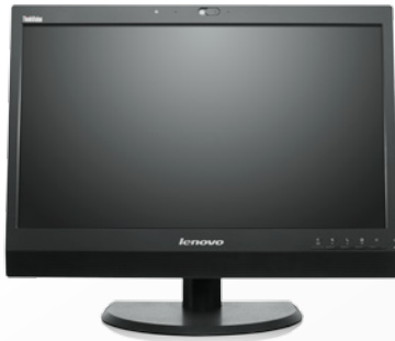
ThinkVision® LT2323z Monitor