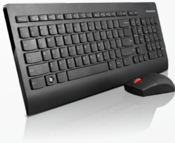
Lenovo® Ultraslim Wireless Keyboard and Mouse Combo (0A340xx)