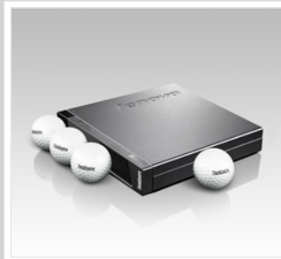
Tiny Form Factor Tiny is as compact as golf ball