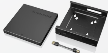
ThinkCentre Tiny Storage Unit (0B47375) ThinkCentre Tiny VESA Mount (0B47374)