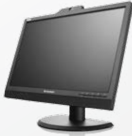
ThinkVision® LT2323z Monitor