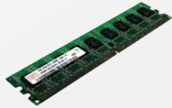
PC3-12800 DDR3-1600 UDIMM Memory