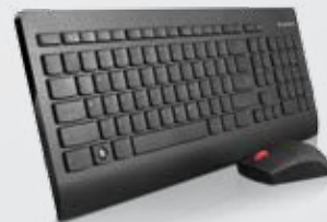
Lenovo® Ultraslim Wireless Keyboard and Mouse Combo