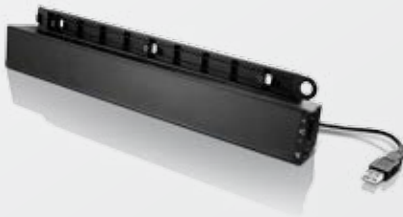
Lenovo® USB Soundbar