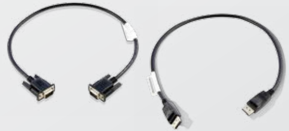
ThinkCentre® Tiny 0.5 DP and VGA Cable