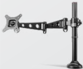
ThinkCentre® Extend Arm