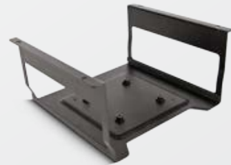
ThinkCentre® Tiny Underdesk Mount