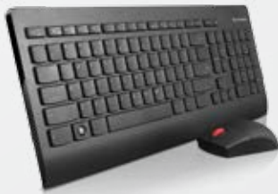
Lenovo® Ultraslim Wireless Keyboard and Mouse Combo