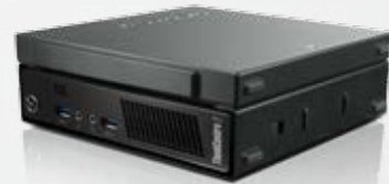
ThinkCentre® Tiny Storage Unit