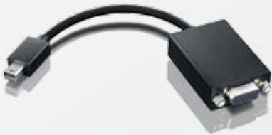
DisplayPort to Dual-DisplayPort Monitor Cable