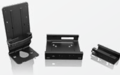
ThinkCentre® Tiny L-Bracket Mounting Kit