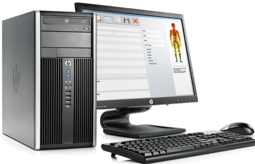
Monitor sold separately.