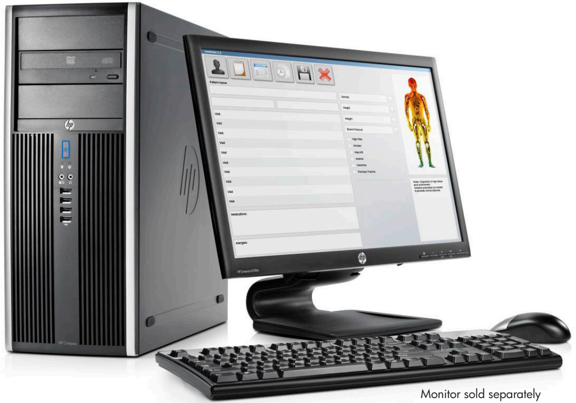
Monitor sold separately