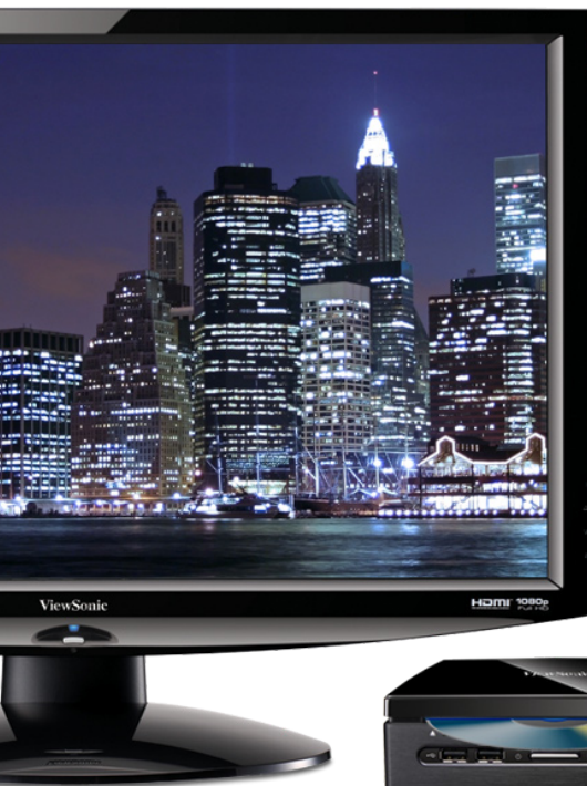
Monitor sold separately.

The hottest choice for fast computing and managing Blu-ray, DVDs, Hulu, YouTube or any high definition content is the ViewSonic VOT550 PC mini. Powered by an Intel® Core™ 2 Duo processor, with 4GB memory, it is ready to handle your entire entertainment or office hub. Its sleek design uses 50% less plastic and 45% less energy. This PC mini is a powerful yet eco-friendly solution for connectivity and control of all your digital content.