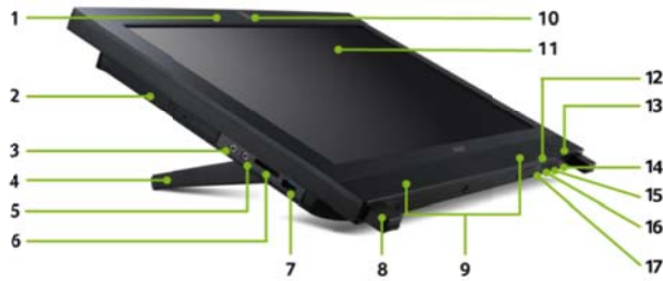
Front view, with frame stand