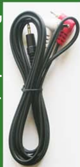
RCA to 3.5mm cable