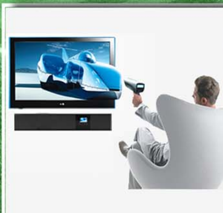
Game enhancement with more realistic sound