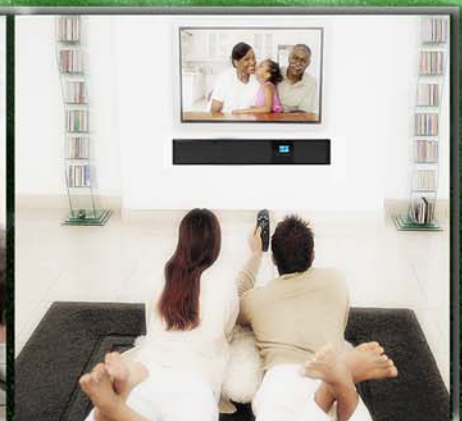
Mounted To The Wall