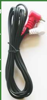
RCA to RCA cable