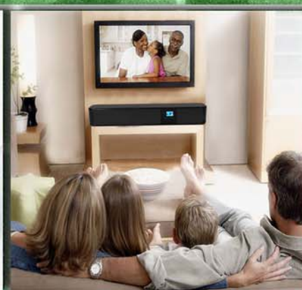
Table Top Placement