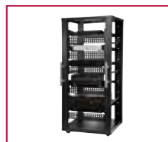
Accommodate most components

■ EASY MOBILITY Rubber wheels for easy movement from location to location