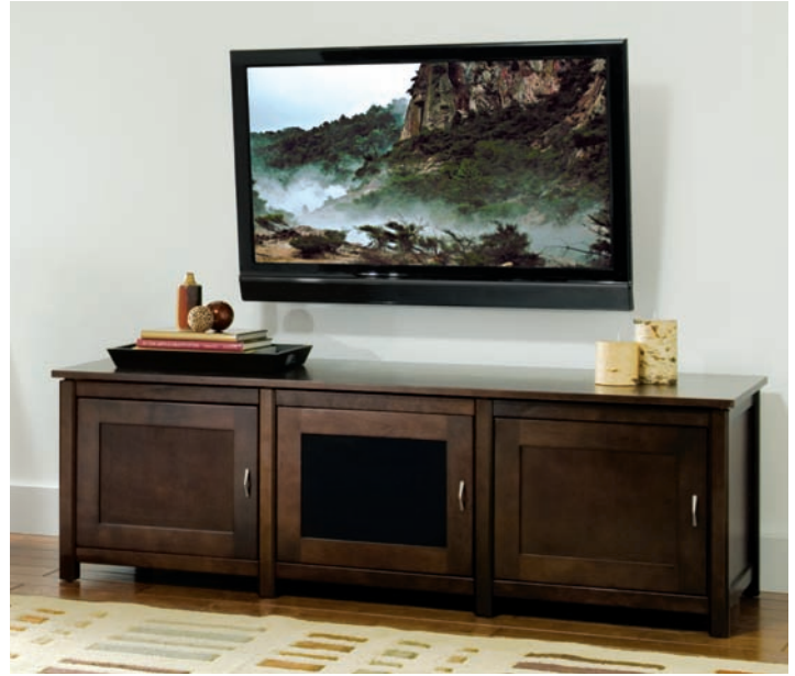
model LT25 shown

The new LT25 tilting mount is the perfect addition to any home theater. Our exclusive ProSet™ post-installation height and leveling adjustments ensure TVs are always perfectly positioned, even after hanging. The innovative ClickStand™ feature holds the TV away from the wall for easy cable installation and maintenance, then easily snaps shut to secure the TV to the wall plate. ClickFit™ technology allows a surge protector and other accessories to attach easily to the center of the mount, so they stay hidden yet easily accessible. And the open wall plate design makes installation a breeze, providing generous space for cable management and easy wall access.