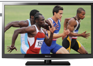
Toshiba LED HDTV

1. While every effort has been made at the time of publication to ensure the accuracy of the information provided herein, product specifications, configurations, system/component/options availability are subject to change without notice. 2. 1080p/24 fps encoded content and an HD display capable of accepting a 1080p/24Hz signal required for viewing 1080p/24 fps content.