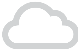
WiFi Network (wired or wireless)