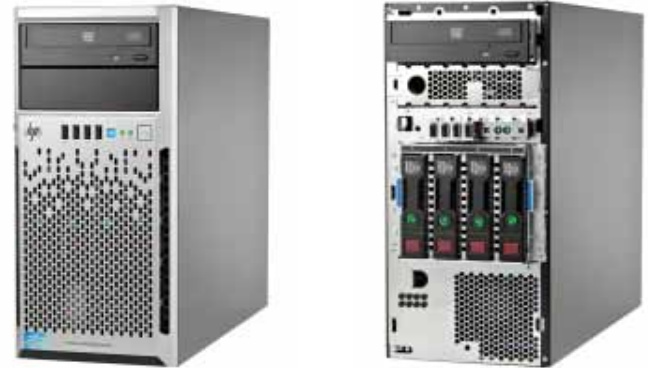
HP ProLiant ML310e Gen8 8 SFF model with locking bezel