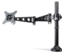
ThinkCentre Extend Arm - 57Y4352