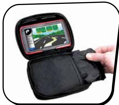
Weighted support base is easy to remove for lightweight portability.