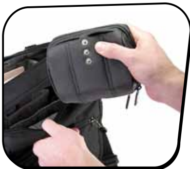
Easy to grab and go for quick storage and added security.

Use with Garmin®, Magellan®, TomTom® and most other popular brands.