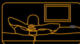
In your living room...