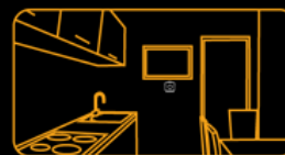
In your kitchen...