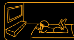
In your bedroom...