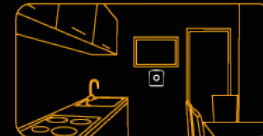
In your kitchen...