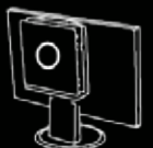
or LCD mount