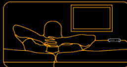
In your living room...