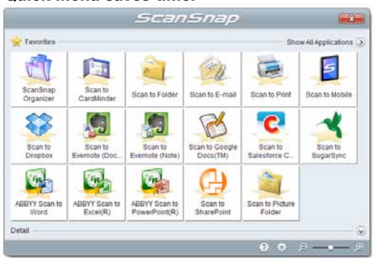
Quick Menu for Windows® shown

The ScanSnap Quick Menu for PC and Mac automatically pops up after scanning to provide you a variety of ways to be immediately productive with your scans. It can be easily customized to display just your favorites, present a recommendation, and even display custom profiles.