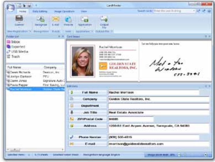
CardMinder for Windows® shown

Scan, store, and edit business card information with the bundled CardMinder software for Mac and PC and even export data into other applications like Address Book, Excel, and Salesforce.