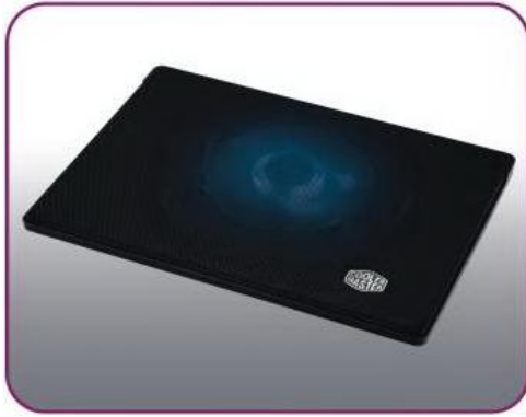
Slim and Lightweight