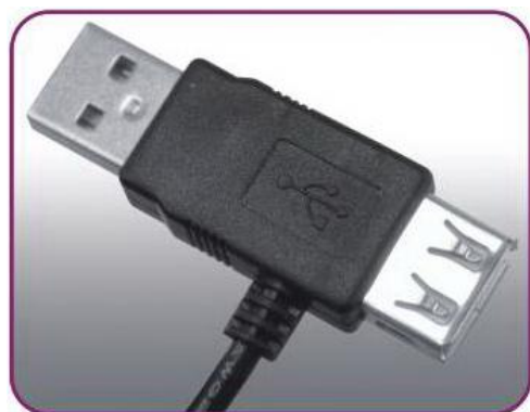
USB Port Extender

Note: Photos may differ slightly from the final product