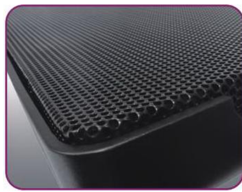
Full Range Mesh