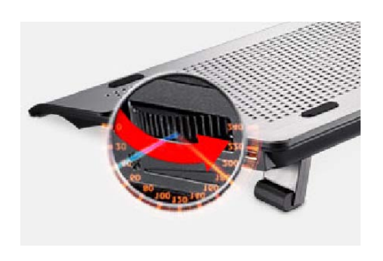
Fan speed controller