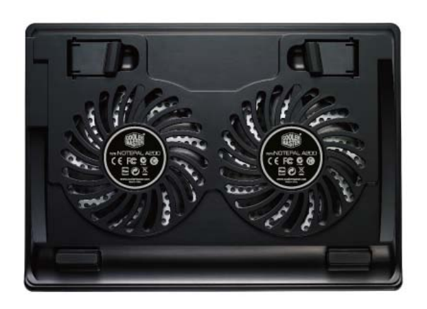
Dual 140mm fans