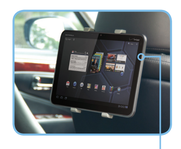
Comes with car headrest attachment