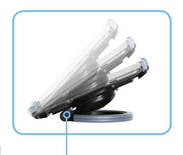
Easy viewing angle and height adjustment