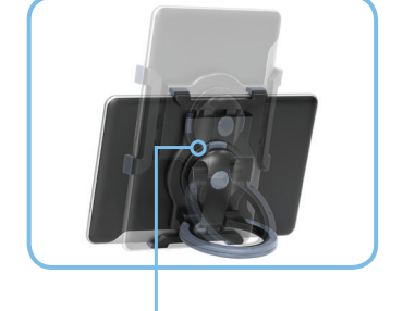
Landscape to portrait rotation