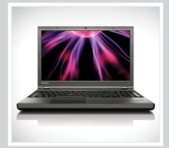
SUPERIOR CLARITY 15" HD, Full HD, and 3K resolution display options, for true-to-life visuals