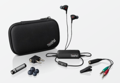
0B47313 ThinkPad Noise Cancelling Earbuds

40A00000WW - ThinkPad Basic Dock (no AC Adapter) 40A00065AU - ThinkPad Basic Dock - 65W 40A10065AU - ThinkPad Pro Dock - 65W 40A20090AU - ThinkPad Ultra Dock - 90W 40A20135AU - ThinkPad Ultra Dock - 135W