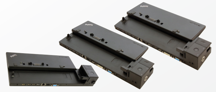
ThinkPad Docks 2013

40A00000WW - ThinkPad Basic Dock (no AC Adapter) 40A00065AU - ThinkPad Basic Dock - 65W 40A10065AU - ThinkPad Pro Dock - 65W 40A20090AU - ThinkPad Ultra Dock - 90W 40A20135AU - ThinkPad Ultra Dock - 135W