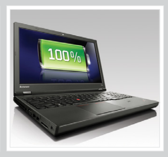
LONG-LASTING PERFORMANCE Up to 13 hours of battery life<sup>1</sup> on a single charge

The Lenovo® ThinkPad® T540p is the ultimate enterprise performer. Ready to handle any workload, the laptop offers 4<sup>th</sup> generation Intel® Core™ processors, up to 1TB storage, and Up to 13 hours of battery life<sup>1</sup>. Bolster your working efficiency with the ThinkPad Precision keyboard and the larger trackpad that supports Windows 8 gestures. The stunning 15" display, available in 3K resolution, HD, or Full HD brings all of your applications to life.