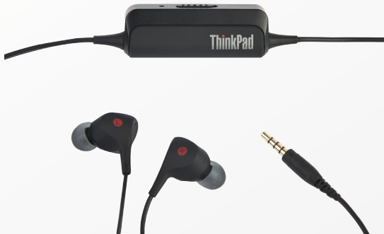
ThinkPad Noise-cancelling Ear Buds (0B47313)