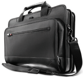
ThinkPad Deluxe Expander Case (43R2478)