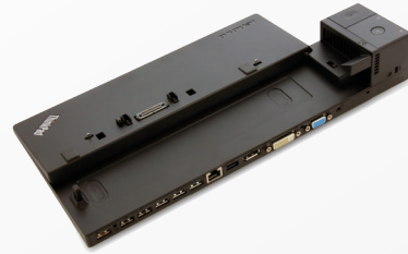
ThinkPad Ultra Dock - 135 W (40A20135xx)