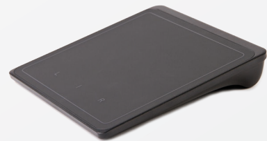
Lenovo Wireless Touchpad (0A33909)