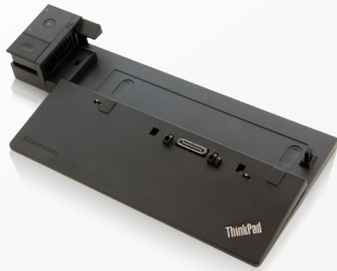
2013 ThinkPad® Docking: ThinkPad® Ultra Dock(40A20090XX), ThinkPad® Pro Dock (40A10065XX), ThinkPad® Dock (40A00065)