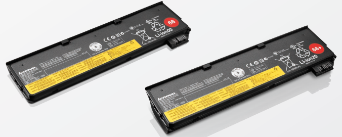
ThinkPad 68/68+ Battery ThinkPad 68 (3 cell) - PN 0C52861