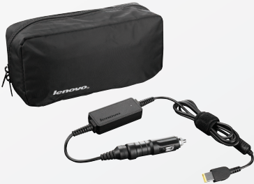
Lenovo® 65W DC Travel Adapter (0B47481)