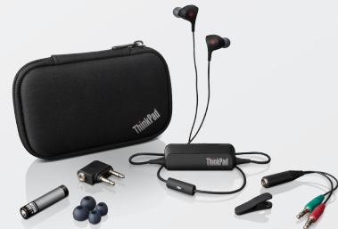
ThinkPad Noise-Cancelling Ear buds (0B47313)