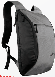
ThinkPad® Ultralight Backpack