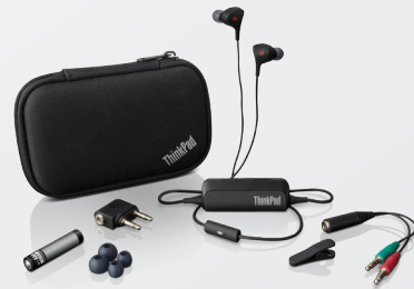
ThinkPad Noise-Cancelling Earbuds