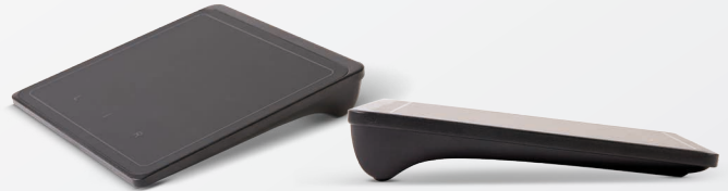
Lenovo® Wireless TouchPad (for non-touch models)