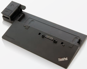
New ThinkPad docking for security, connection, and power