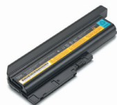
ThinkPad Battery 52 3-cell (0A36285) ThinkPad Battery 52++ 6-cell (0A36286) ThinkPad Battery 19+ 6-cell Slim External (0A36280)