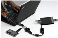
Lenovo 90W Ultraslim AC/DC Combo Adapter (41R4493)