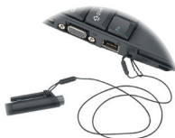
Tablet Tether (41U4820)