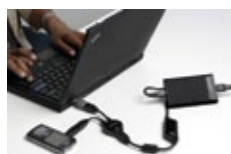
Lenovo 90W Ultraslim AC/DC Combo Adapter (41R4493)