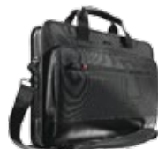
ThinkPad Business Topload (43R2476) ThinkPad Business Backpack (43R2482)