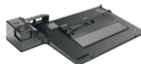
ThinkPad Mini Dock Plus Series 3 (170W) (4338-30U)