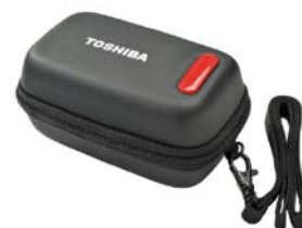
CAMILEO carry case PX1659E-1NCA