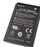
CAMILEO battery 1400 mAh PA3985E-1BRS