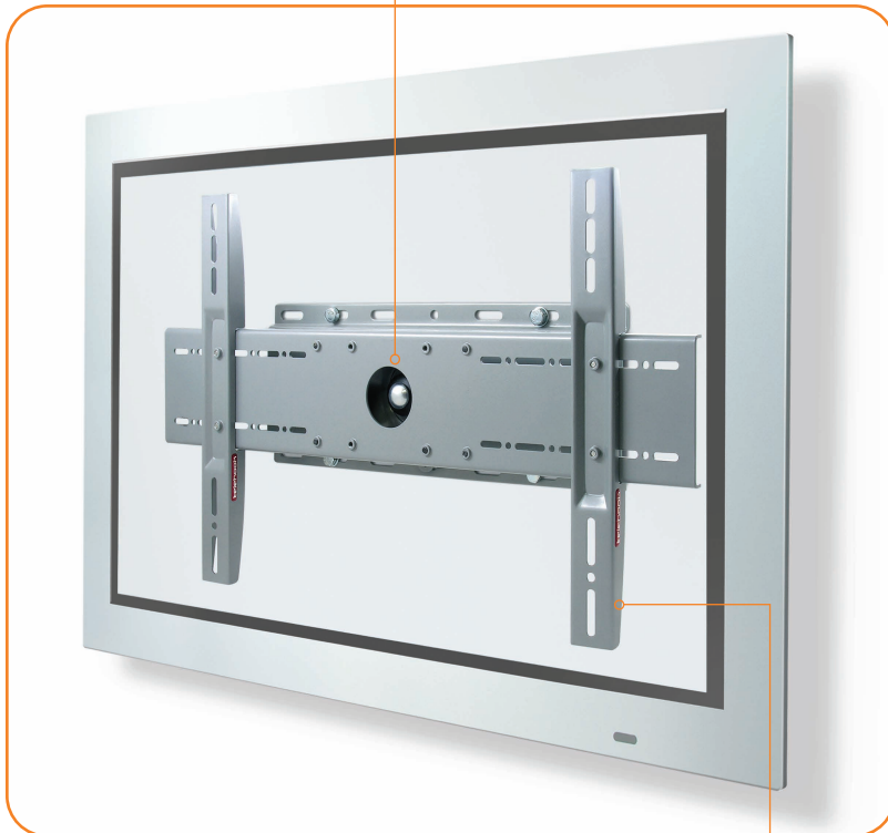
Universal mounting hole pattern