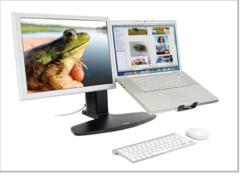
Neo-Flex Combo Lift Stand supports a display next to a laptop computer, positioned on the left or right side. Use with a separate keyboard and mouse (not included)

\circledast 2014 Ergotron, Inc. \, rev. 07/15/2014/EA \, Literature made in US Content is subject to change without notification