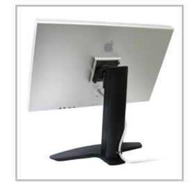
Neo-Flex Widescreen Lift Stand supports a large display up to 32" and provides lift of 5" (13 cm)

Neo-Flex Dual Lift Stand supports two displays up to 24" each and provides lift of 5" (13 cm)