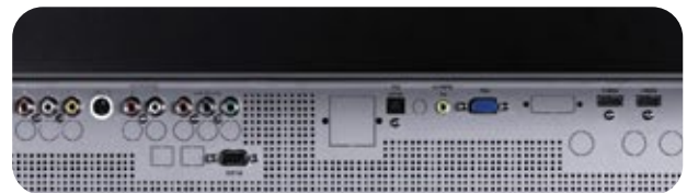
INF5501 Connectivity Options