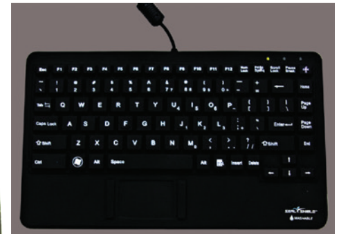
S86PG2 All-In-One Waterproof Keyboards 86 key layout plus backlit on/off key Backlit keys