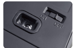
on / off switch