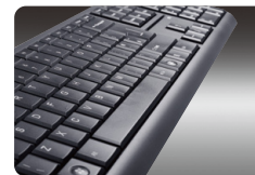
Smooth palm rest design