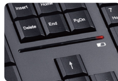
Low battery signal