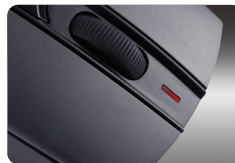
Low battery signal