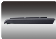
Thin and low profile