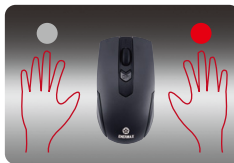
Usable with both hands