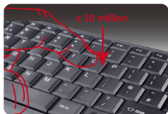
10 million keystrokes