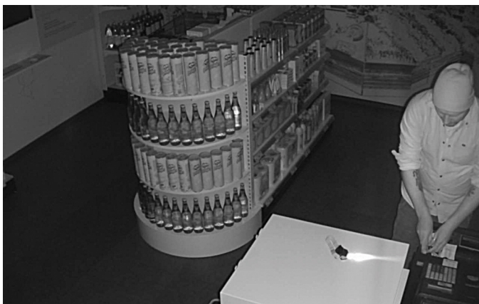
As light diminishes below a certain level, the cameras can automatically switch to night mode to deliver quality images in dark environments.

AXIS M11-L Series provides day and night varifocal built-in lens and adjustable IR LED illumination for optimal light in selected viewing angles. With Axis OptimizedIR, a power-efficient LED technology that provides an adaptable angle of IR illumination and discreet integration of IR LEDs, the cameras provide automatic illumination of a scene in complete darkness, at an event or when requested by a user. The IR LED illumination which is invisible to the human eye, is perfect for discovering objects in a range of up to 15 meters (50 ft)